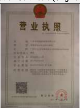
Certification & Photos -- Custom Clearance Registration Form

Certification & Photos -- Business License Combined with Organization Code Certificate, Tax Registration Certificate (Original)