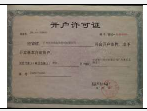
Certification & Photos -- Import and Export Enterprise Registration